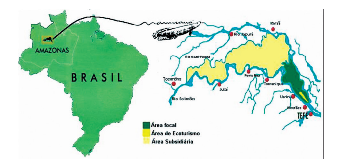
Figure 1. Mamirauá area

Environmental setting and subjects. The Mamirauá and Amanã Sustainable Development Reserves (MSDR and ASDR, respectively) are located about 600 km West of Manaus (Amazonas) in the Brazilian Amazonian region (Figures 1 and 2). The reserves are contiguous conservation units designed to integrate the preservation of habitats with sustainable development of local resident communities. These areas are seasonally flooded, with water levels rising 10 to 12 meters above normal in the rainy season. The population lives in small communities along the riverbanks, each comprising 13 domestic households on average, which are typically linked by kinship ties that characterize the communities as nuclei of small groups of related individuals. The houses are timber-built and raised off the ground to protect them from high water levels. It is essentially a subsistence-based economy, with very low incomes (annual family income of about US$900). Activities are divided among fishing, growing manioc for flour and in some communities, hunting; which is practiced throughout the lifetimes of most subjects. Only among the elderly do physical activities decrease. Women tend to work making flour, housekeeping and taking care of children.