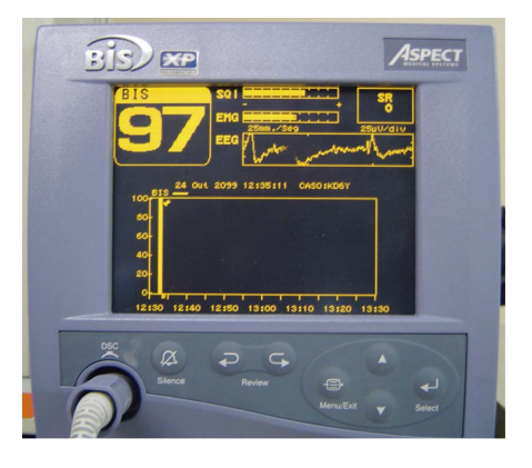
Figure 2 Bispectral index monitor.

An independent observer was responsible for the mo-