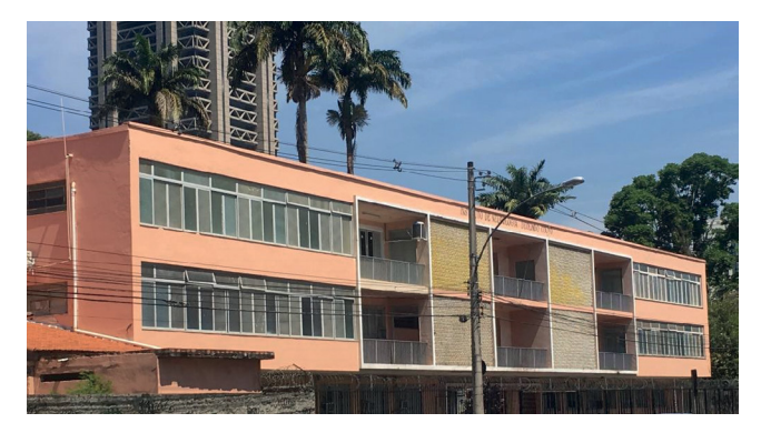
Figure 3. Institute of Neurology in Brazil. The first Institute of Neurology in Brazil, located in Rio de Janeiro, and founded in 1946, by Deolindo Couto.