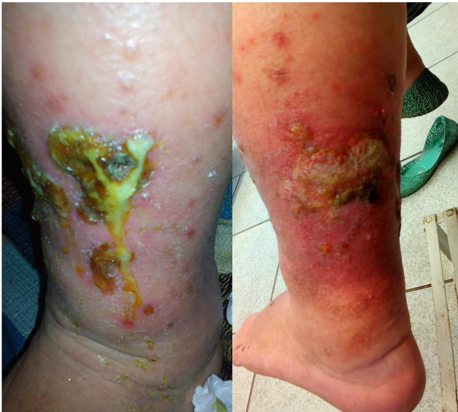
Fig. 1. Lesion with lymphedema in the left leg. Lateral views.

of Hospital das Clínicas – Universidade de São Paulo (CAAE 34949120.0.0000.0068). The patient signed the informed consent.