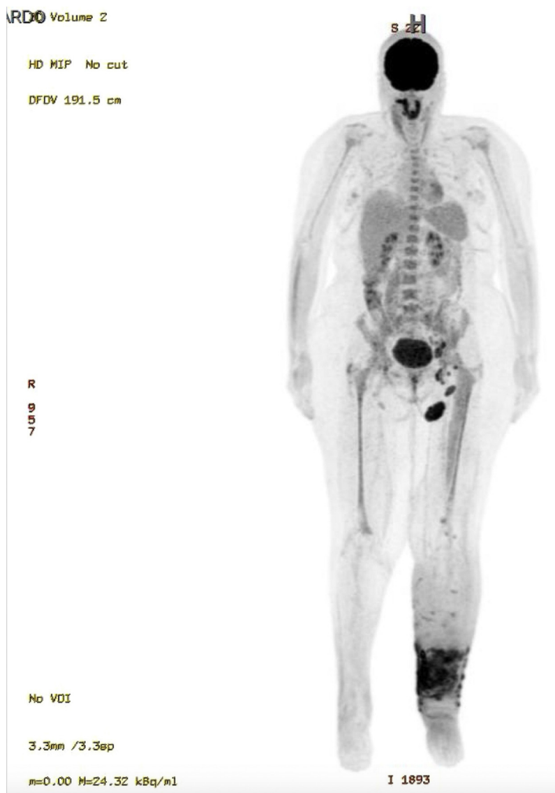
Fig. 2. PET SCAN showing: Skin thickening associated with densification of the subcutaneous plane of the left leg; Lymph nodes and lymph node enlargement in the left femoral and inguinal chains.