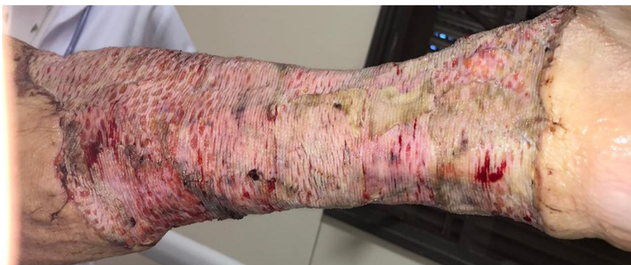
Fig. 5. Left leg after skin grafting.