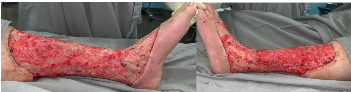
Fig. 4. Left leg after resection of the lesion.