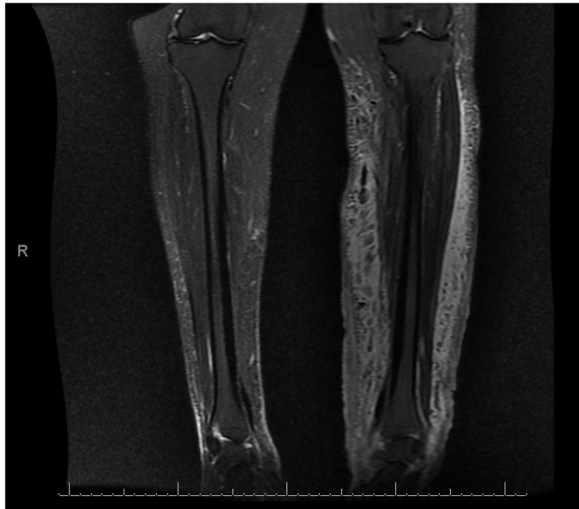
Fig. 3. MRI showing the plane of the intact muscle fascia.