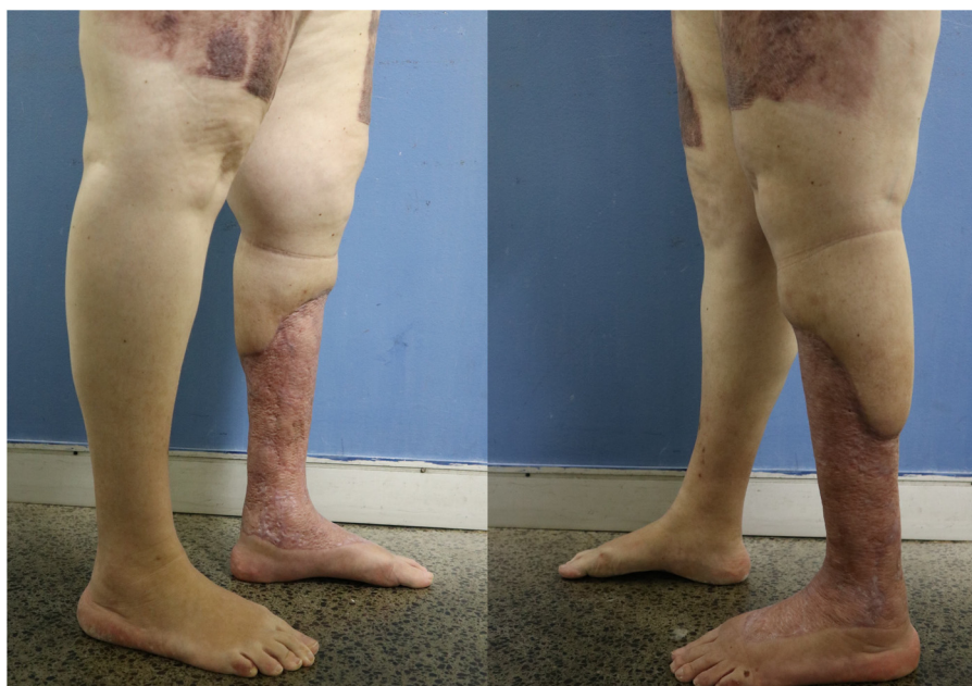
Fig. 7. Patient's follow-up (six months).