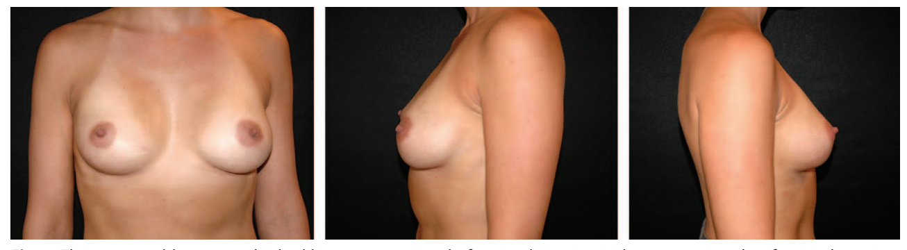
Fig. 5. The 39-year-old woman who had breast asymmetry before implantation is shown at 6 months after implantation. Natrelle 410 implants with full height and moderate projection (235 g) and with moderate height and low projection (170 g) were used on the right and left sides, respectively.