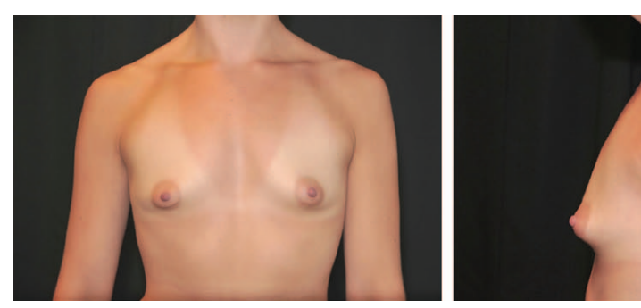
Fig. 2. A 31-year-old woman with tuberous breasts, empty lower pole, and convexity in the upper chest wall is shown before implantation.